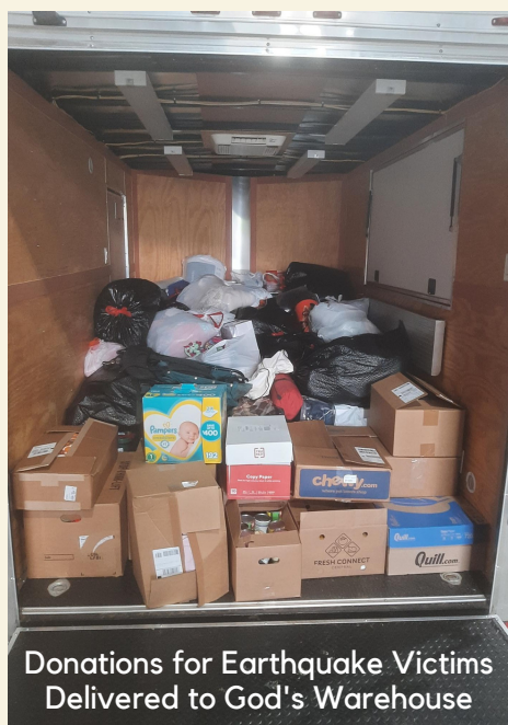
Donations for Earthquake Victims Delivered to God's Warehouse