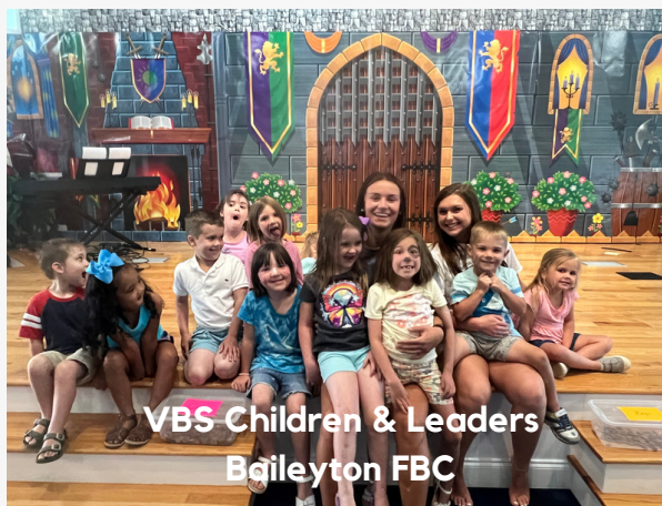
VBS Children & Leaders Baileyton FBC